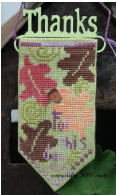
cw-55 Thanks Clip- Baltimore Exclusive 30ct Guacamole WDW