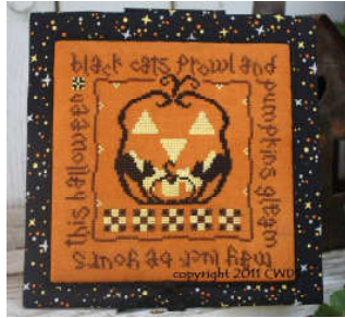
cw-52 Black Cats Prowl 30ct Tiger's Eye WDW