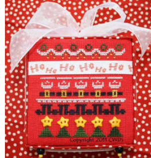
cw-53 HoHoHo Ribbons 30ct Liberty WDW