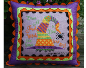
cw-54 Good Witch 18ct Sweet Lavender